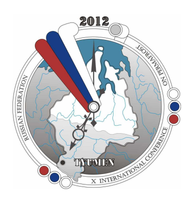
25-29 June 2012